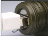
EMC Shroud (front view) – conductive surface with shielded cable and receptacle or chassis ground

Many applications that require the use of higher data rates require proper grounding and shielding. To address this, L-com offers our Zinc-Nickel finished line of RJ45 Ruggedized jacks which are designed to establish sufficient grounding between shielded cord sets and chassis ground. They also provide EMC/EMI shielding for applications where immunity to electromagnetic interference is crucial. The parts provide >0.033\Omega for shielded cable to cable or cable to ground use. This is accomplished using a grounding plate, conductive O-ring and gasket. The parts adhere to and are tested to IAW MIL-STD-461F, RS103 for EMI emission and susceptibility.