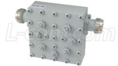
Indoor Model: BPF900