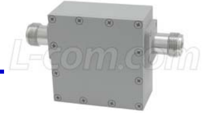
Outdoor Model: BPF900A