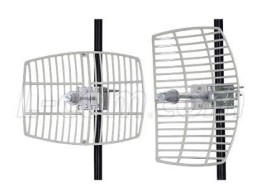
Vertical or Horizontal Polarization

This antenna is supplied with a 60 degree tilt and swivel mast mount kit. This allows installation at various degrees of incline for easy alignment. They can be adjusted up or down from 0° to 60°.