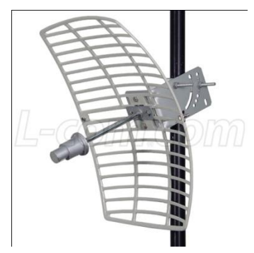
Tilt & Swivel Mast Mount