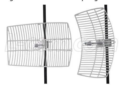
Vertical or Horizontal Polarization

This antenna is supplied with a 60-degree tilt and swivel mast mount kit. This allows installation at various degrees of incline for easy alignment. They can be adjusted up or down from 0° to 60°.