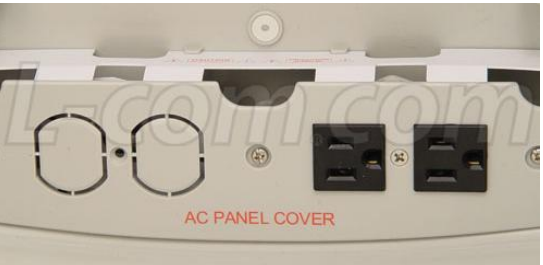
120 VAC Power Panel