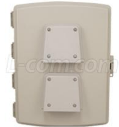
Vented Lid with Rain Shields in place