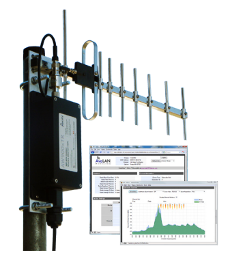
(Product shown with optional AW11-900 Antenna)

To speak to a live technician, please call technical support at the number below during normal business hours.